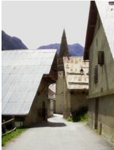
As seen coming from Plampinet

To Briançon, Montgenèvre and Val des Prés "Le Rosier"