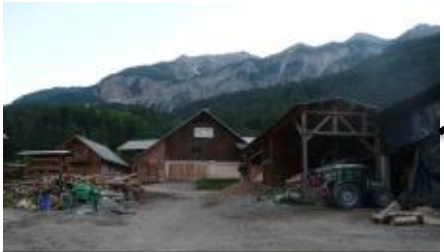
The wood yard