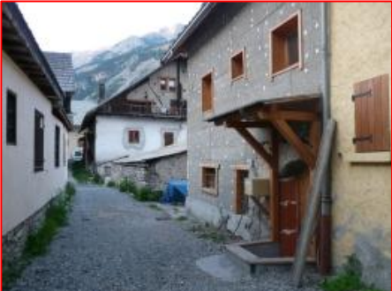
The flat entrance !