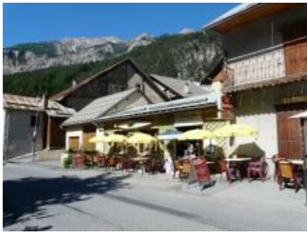
Café des Alps

To Plampinet, Nevache and Bardonecchia via the "Col de l'Echelle"